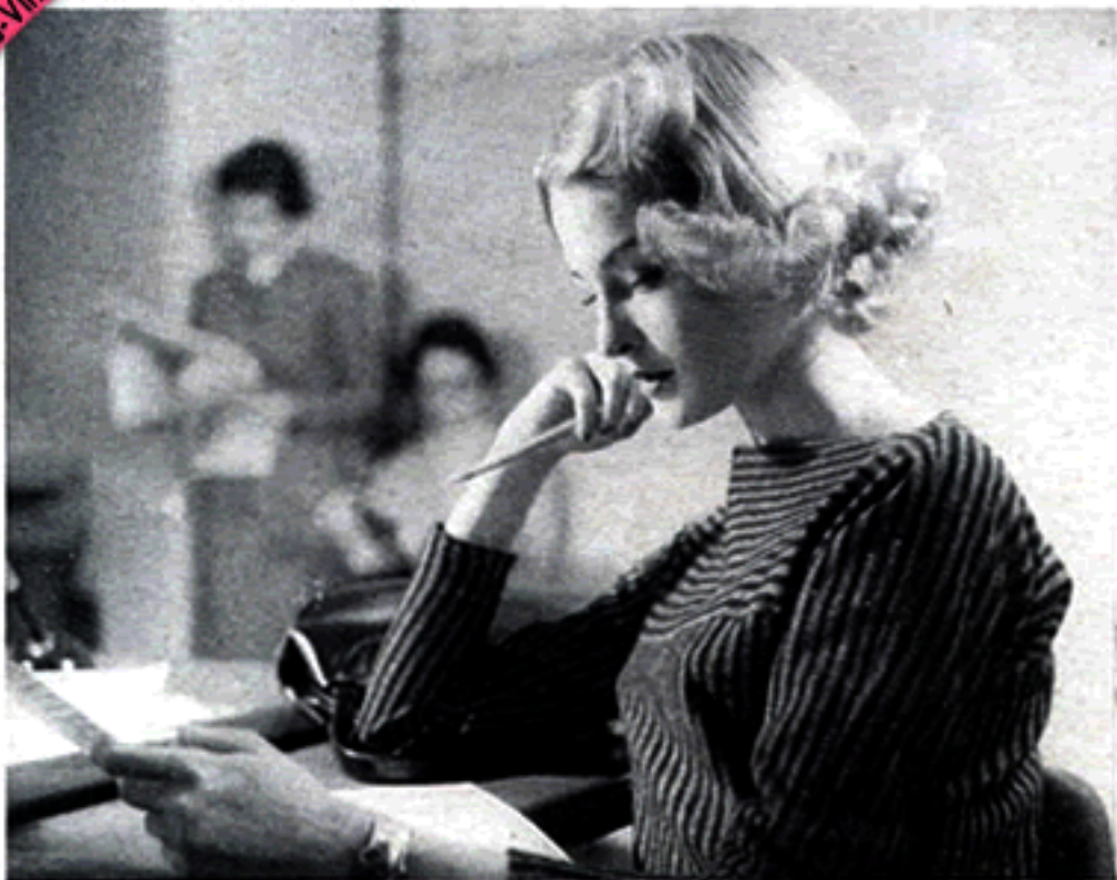
Pretty girl who "can't do a thing with her hair" begins Home Hair Stylist Course by filling out detailed questionnaire aimed at discovering what she does now and how she'd like her hair to look