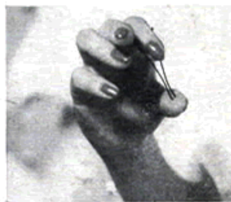
Student practices right way to open bobby pins — not with her teeth