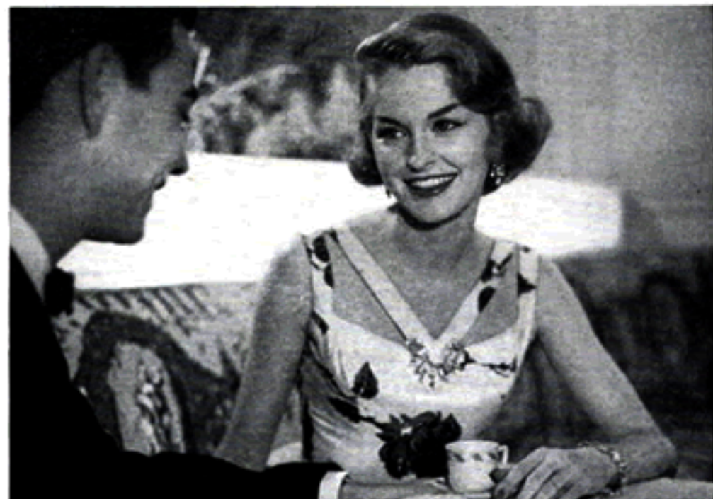
Out for the evening — and she never looked prettier. The girl who was once "all thumbs" has learned to handle her own hair like a professional