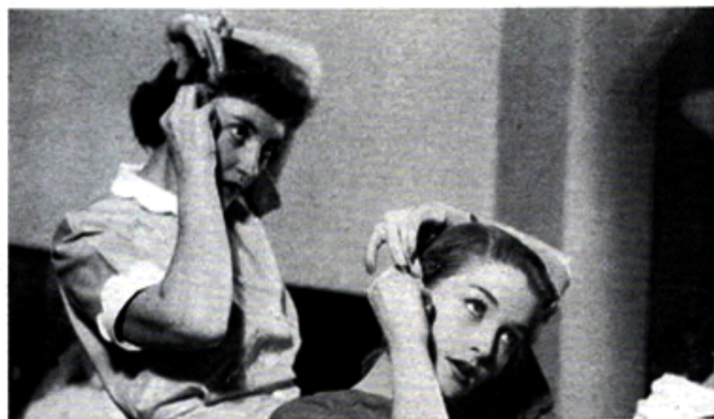
Back to the salon two weeks later for a progress check. After a shampoo she sets her own hair under instructor's supervision. She may try several times before set is judged perfect. After drying, she does comb-out