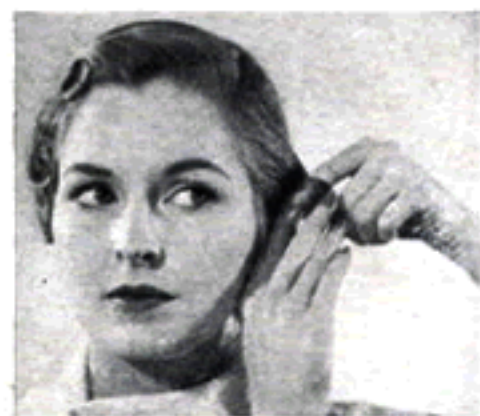
Sliding a pin curl off finger without musing it takes practice too